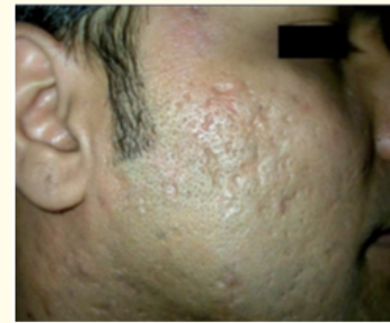
Figure 2: Boxcar scar [9].

for the treatment of these superficial scars [13]. It entails inserting a tiny needle into the scar on the periphery and pushing it back and forth to release the fibrous bands. The wound healing process is aided by the loosening of adhesions, which allows for bleeding and the formation of new collagen [14].