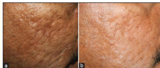
Figure 4: Improvement in acne scars after treatment with MFR [26].

Microneedling fractional radiofrequency (MFR) has also been explored in recent literature to treat moderate to severe acne scars [26]. A retrospective study showed an 85.71% two grade improvement in the grading of the acne scarring. Patients underwent four MFR sessions with 6-week intervals between each session (Figure 4).