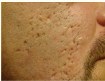
Figure 1: Icepick scar [9].

Ice pick scars (Figure 1) are deep (extending to the dermis) and narrow (less than 2 mm) [9]. They account for 60-70% of atrophic scars and are often more difficult to treat due to the depth of the scar, which makes treatment methods for rolling and boxcar scars ineffective [10]. Punch excision is a common treatment that is used that creates a smaller scar which heals quickly [7,8]. The CROSS procedure (chemical reconstruction of skin scars) has also been a recent option for ice pick scars [11]. This entails dipping a syringe needle or wooden applicator into concentrated trichloroacetic acid (TCA) solution and applying it locally onto the scar.