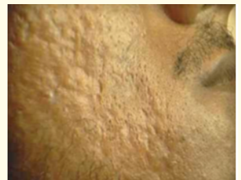
Figure 3: Rolling scar [9].