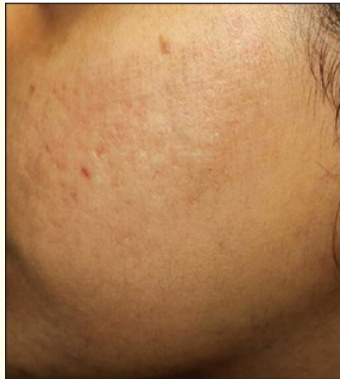
Figure 5: Track marks from the device probe after treatment [26].

Results were particularly effective in rolling and boxcar scars compared to ice pick scars. Mild erythema, post inflammatory hyperpigmentation, and track marks from the device were the noted side effects (Figure 5).