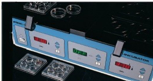
Figure 3: (Left) K-MAR-5100B aspiration unit (Cook IVF).