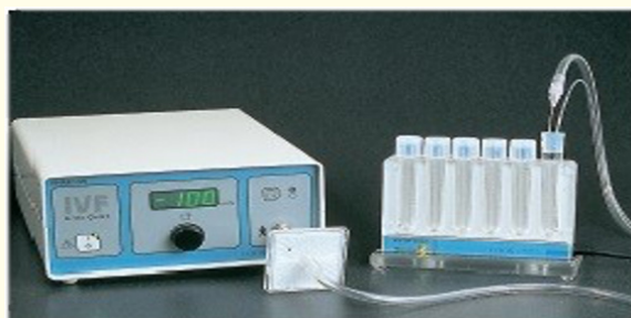
Figure 4: (Right) K-FTH 1012 Falcon tube heater and connecting tubing (Cook IVF).