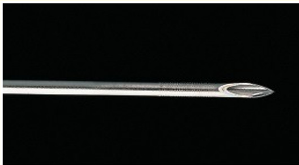
Figure 5: (Left) Needle showing echo tipping to obtain a bright image on ultrasound (Coo IVF).