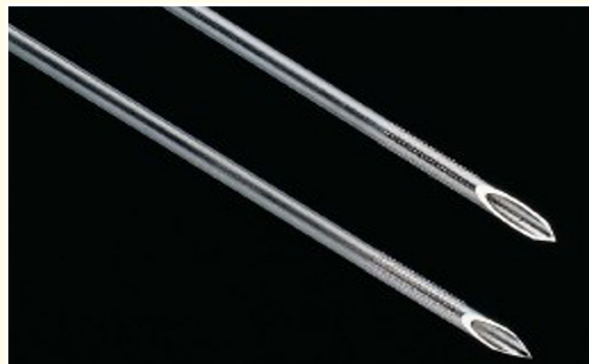
Figure 6: (Centre) Needle with different bevels (Cook IVF).