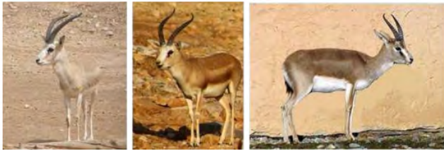
Figure 1: Male Arabian sand gazelle ( Gazella marica ) kept at KKWRC in Saudi Arabia (left), male 'hybrid' gazelle in Kizilkuyu Gazelle Breeding Station in southern Turkey (centre), and male goitered gazelle ( Gazella subgutturosa ) held at the Hluboka' Zoo in Czech Republik (right).

Gazelles kept at KGBS as well as in the in private collections of Şanlıurfa Province are generally regarded Arabian sand gazelles ( Gazella marica ; [35,36], Figure 1), although morphologically they exhibit several traits characteristic of goitered gazelles ( Gazella subgutturosa ; [35]). Females of Gazella marica have well-developed horns and produce regularly twins, while those of Gazella subgutturosa hardly possess horns and rarely produce twins [34,37]. In contrast, gazelles bred at the King Khalid Wildlife Research Centre (KKWRC) are genetically and phenotypically confirmed to be pure Arabian sand gazelles [38]. For further information on the distribution, ecology, and behaviour of Arabian sand gazelles see [37,39].