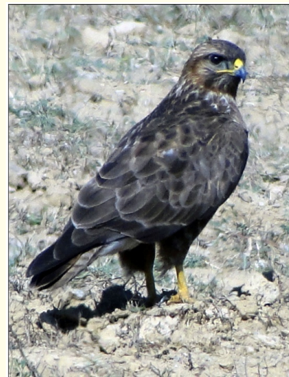
Figure 1: Buteo socotransis .