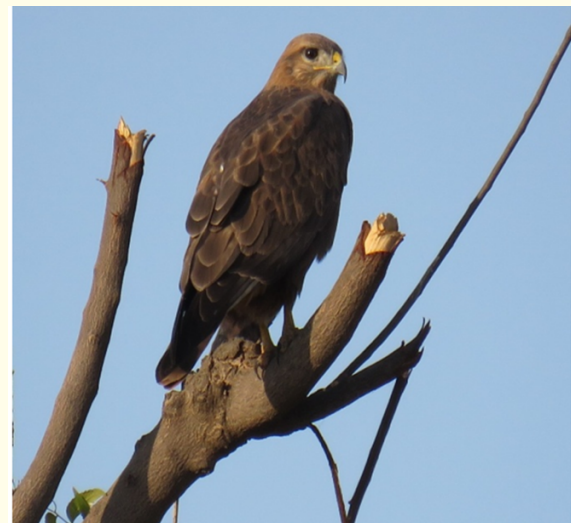
Figure 2: Buteo buteo .