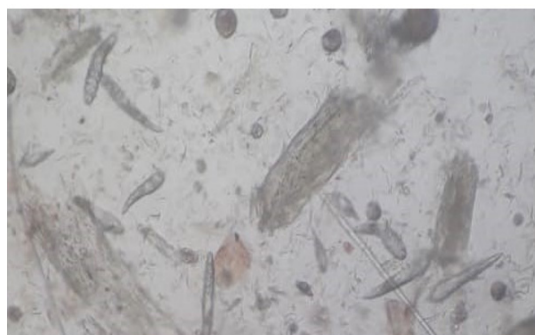
Figure 2: Demodex canis confirmation under compound microscope.