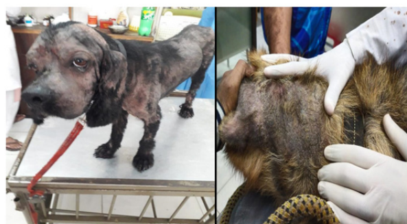
Figure 1: Dogs suspected for demodex infestation.

The data originating from different studies was analyzed by using descriptive analysis and one sample t-test.