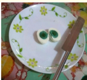
Green Yolk Egg

The curious case of six hens in the small poultry farm of A.K. Shihabudheen, a native of Othukkungal in Malappuram, laying eggs with green yolks.