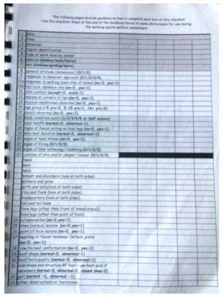
Figure 2: Checklists for scoring.