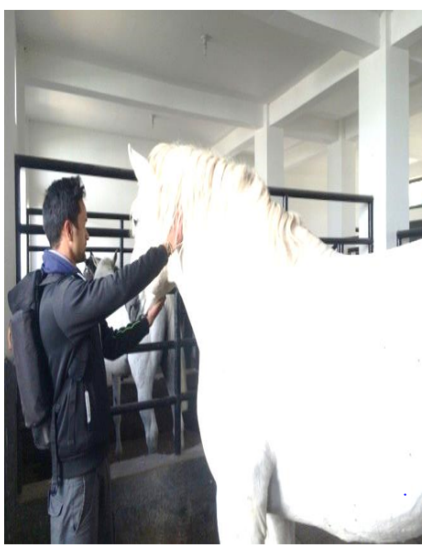
Figure 3: Collection and scoring of data using a non-invasive method.