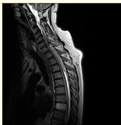
Figure 1: An acute dorsal epidural collection at C6-T3. It is both central and slightly eccentric to the right. It is multiloculated with septations and heterogeneity. It is hypointense on T1, slightly hyperintense on T2 and avidly hyperintense on STIR sequence.

Over two years later this gentleman did not make any progress in his mobility or sensation regardless of extensive rehabilitation.