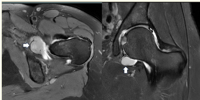
Figure 1: MR images with axial and coronal cuts showing the anterior, medial and inferior locations of the cyst (solid white arrow). The contents of the cyst exhibited an intermediate high signal density on these T2-weighted images.

This article describes a 49-year-old female who presented with a large, atypical, anterior inferomedial paralabral cyst in addition to the conventional features of hip femoroacetabular impingement of a torn anterosuperior labral with an associated CAM lesion on the femoral head-neck junction. Utilizing the descriptive features mentioned above during her hip arthroscopy, other symptomatic paralabral cysts of similar location can be reliably located and identified, and appropriate decompression can be performed to drain the cyst. Cystic lesions that occur near the joint may be clas-