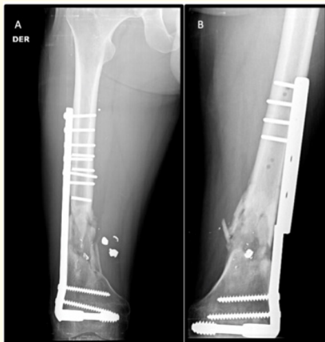
Figure 2: Implant failure.

The main outcome of this study was the significantly higher failure rate of osteosynthesis in the group of patients treated with DCS compared to RN. After one year of follow-up there were no cases of implant failure with the use of RN, and the percentage of thromboembolic events was comparable to fractures operated with DCS. When analyzing the causes of implant failure in the 4 patients (28.5%) who failed in group 1 (DCS), there were 2 cases of plate fracture, 1 case of plate bending and in the remaining case a failure of the shaft screws (Figure 2). Three of these 4 patients had a comminuted gunshot fracture and all had a history of poly-drug use. The remaining case corresponded to a woman older than 60 years, with a low energy trauma and history of diabetes mellitus.