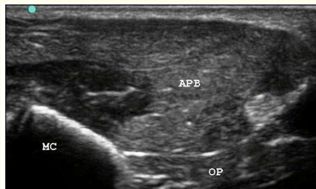
Figure 4: Sample transverse image of the abductor pollicis brevis muscle from the Sonosite M-Turbo (Sonosite, Inc., Bothell, WA) using a 13-6 MHz multi-frequency, broadband, 25 mm linear array in musculoskeletal optimized B mode at 2.2 cm depth. Abbreviations: APB, abductor pollicis brevis; OP, opponens pollicis; MC, 1 st metacarpal.