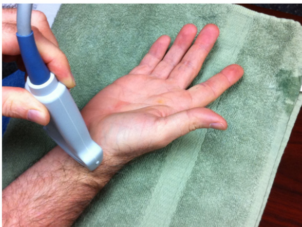
Figure 1: Example of rehabilitative ultrasound imaging after carpal tunnel release of median nerve at the carpal tunnel from the Sonosite M-Turbo (Sonosite, Inc., Bothell, WA).

with high grip strength ( r(3) = -0.5 ) as well as a large correlation between small MN circumference and greater APB MT was significant ( r(3) = -0.952, p = 0.012 ).