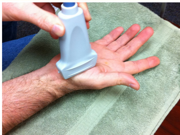
Figure 2: Example of rehabilitative ultrasound imaging after carpal tunnel release of abductor pollicis brevis muscle from the Sonosite M-Turbo (Sonosite, Inc., Bothell, WA).