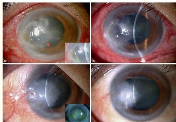
Figure 1: Photographs of the right eye before and after treatment a. At the first visit,(a ) A brownish pigmented lesion on the epithelial surface and anterior stroma also a whitish infiltration with a feathery edge were presented at cornea at the first visit.(b) Corneal plaques and dense infiltrate were found one week after medical treatment.(c) The lesion was replaced by a corneal scar without an overlying superficial corneal plaque and epithelial defect after five weeks of medical treatment. (d) After 2 months of treatment the lesion became a corneal scar.