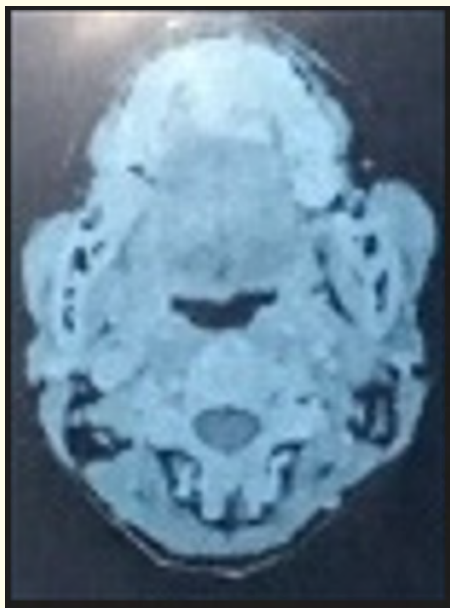
Figure 2: CT scan image showing the extent of lesion.

Computed tomography (CT) revealed exophytic heterogeneously enhancing mass with erosion of anterior one-third of palate and inner cortex of bony maxillary alveolus at level of central incisors and lateral canine with jugular lymphadenopathy, largest 23*20 mm in left upper jugular chain. Punch Biopsy was taken which was suggestive of poorly differentiated malignancy (Figure 2).