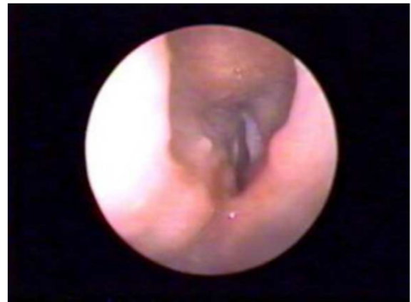
Figure 2: Left vocal cord paralysis.

The vocal cord paralysis is another frequent cause of stridor (Figure 2). Which need to do bronchoscopy to explore the underlying causes. Vocal cord paralysis secondary to Arnold-Chiari syndrome is also found. The unilateral vocal cord paralysis is also found due to iatrogenic repair of cardiovascular disorders, trauma or infections.