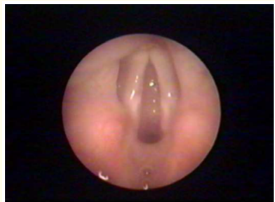
Figure 3: Acquired subglottic stenosis also evaluated by bronchoscopy in children.

Acquired subglottic stenosis is also a frequent cause of stridor, usually secondary to long time intubation (Figure 3). The incidence of acquired subglottic stenosis is increasing due to improved care of premature newborn.