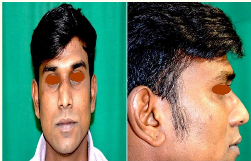
Image 1: Photographs showing the swelling over the right lateral side of nasal dorsum.

ally progressed to the present size as shown in image 1.