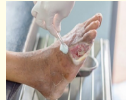
Figure 1: Diabetic foot.

The high prevalence of diabetes also triggers cardiovascular diseases. A study by Russo, et al. In 2023, he reported in his research that "the majority of patients were female (52.6%), with an average age of 70 years, and the chronic non-communicable cardiovascular diseases that were the most frequent comorbidities were: 88% dyslipidemia, 75% hypertension arterial, 55% obesity, 35% smoking and 7% sedentary lifestyle. Which indicates that the elderly adult population continues to present a high cardiovascular risk, with poor compliance with therapeutic objectives [9].