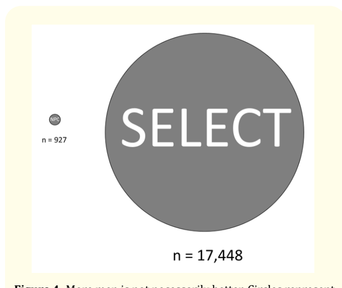
Figure 4: More men is not necessarily better. Circles represent the size of the two largest randomized clinical trials that contributed to estimating the prostate cancer risk reduction achievable with selenium supplementation in a 2018 Cochrane report [3]. The massive SELECT was not powered to test the critical hypothesis: Can men with low selenium status achieve significant prostate cancer risk reduction through supplementation? It follows that the Cochrane analysis, relying on the mathematical combining of results from the mountain of selenium-replete men in SELECT with the men in the NPC trial, would be inadequately equipped to render unbiased support or refutation of the critical hypothesis. SELECT — and therefore the Cochrane report — confirm the unremarkable: Selenium supplementation does not prevent prostate cancer in selenium-replete men.

The words depicting the interaction between these two characters eloquently captures our impressions of the intellectual progress surrounding selenium and prostate cancer and the wholly unsurprising conclusion of the Cochrane review. What can be expected of a conclusion generated by an analysis in which NPC results and SELECT results are combined mathematically? As illustrated in Figure 4, the number of men receiving selenium or placebo in the selenium-replete SELECT study population dwarfed by more than 18-fold the number of participants in the NPC trial.