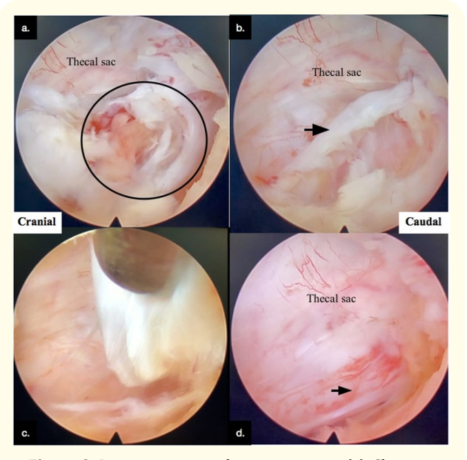
Figure 3: Intraoperative endoscopic images: (a). Showing lumbar facet cyst, (b) facet cyst wall (black arrow), (c) facet cyst wall being removed, and (d) decompressed thecal sac and traversing root (black arrow) after facetal cyst removal.