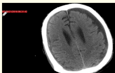
Figure 3: Hematoma of the same size at following CT.

and 139 mmol/l in a few days. Despite the absence of radiological regression in the hematoma or effusion of the patient, the patient's consciousness was fully opened with the recovery of hyponatremia and the patient began to establish normal verbal communication and began taking orders. So the GCS score was 15. The patient could be mobilized by opening the consciousness.