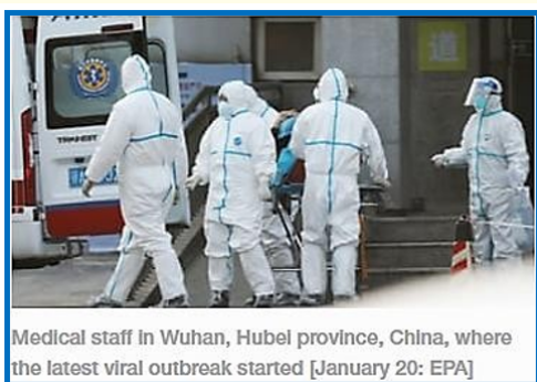
Medical staff in Wuhan, Hubei province, China, where the latest viral outbreak started [January 20: EPA]

The most recent cases in Hong Kong are two women, aged 12 and 41, who have been in Wuhan for the past 14 days but do not appear to have visited the food market, hospital authorities said. They were in stable condition and treated in isolation at Princess Margaret Hospital. Besides SARS, or severe acute respiratory syndrome, Hong Kong was also affected by avian influenza in 1997 and swine flu in 2009.