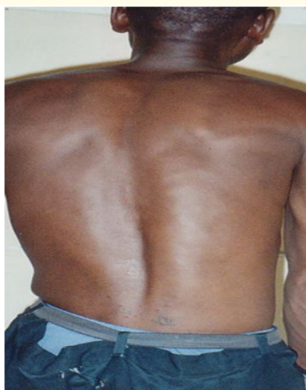
Figure 1: Scoliosis attitude.