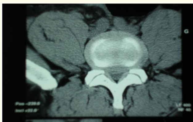
Figure 4: CT scan of the lumbar spine showing a herniated disc.

Biologically, the mean haemoglobin value was 14.2 \pm 2.2 g/dl. The average sedimentation rate was 10 \pm 5 mm at the first hour. The C- reactive protein was negative in all patients.