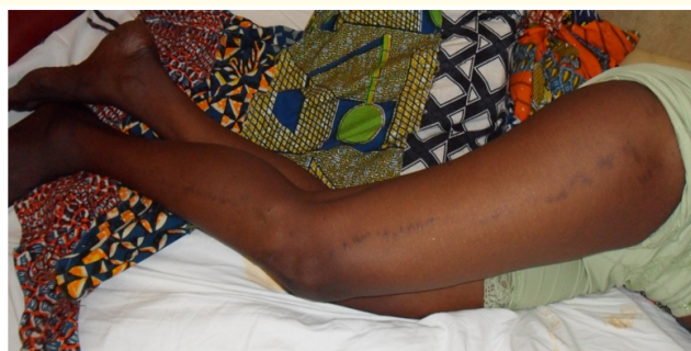
Figure 2: Scarification lesions along the path of the L5 sciatic nerve.

In terms of medical imaging, standard radiography was performed in all patients, it had shown parallelism of the vertebral endplates in 3 cases (3%) and yawning of the intervertebral disc in 2 cases (2%). Saccoradulography (Figure 3) was performed in 76