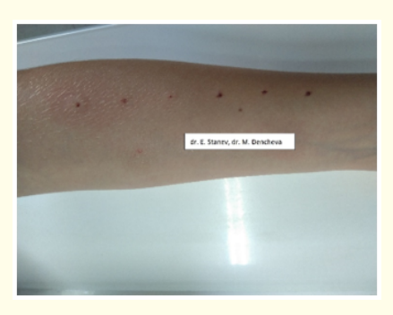
Figure 1: Picture of the forearm after the test.

Results from standard and thermal imaging: