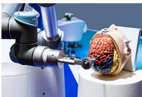
Figure 1: Medical Robot Performing Brain Surgery.

specialist continuously through remote control, with constrained input to the administrator. The third is a common control framework where the specialist straightforwardly controls the developments of the robot as the robot upgrades the specialist's aptitudes through expertise improvement, a term which for the most part portrays mechanical answers for human restrictions, including physiologic tremor decrease (Figure 1).