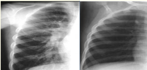
Figure 3: High PBF (left) and low PBF (right).