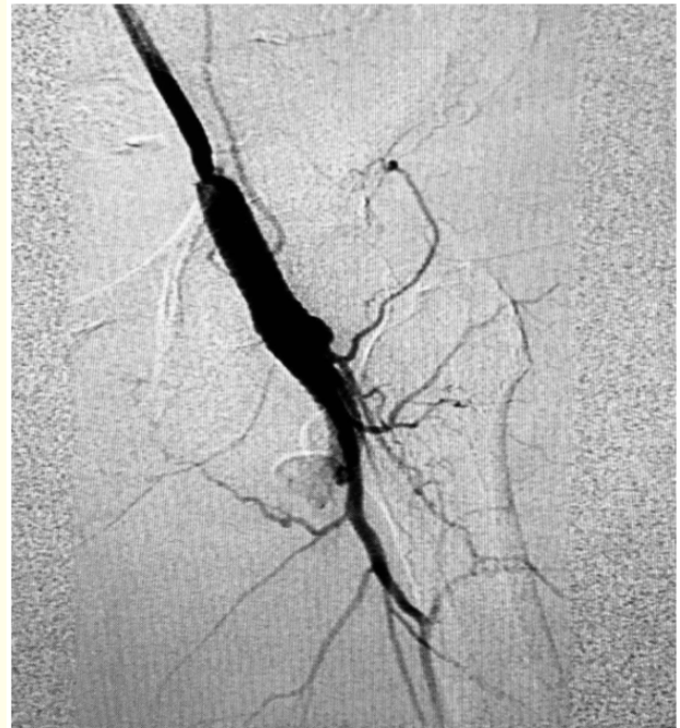
Figure 3: DSA showing proximal SFA pseudoaneurysm and contrast blushing.