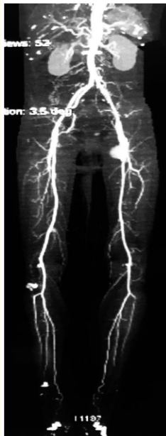
Figure 2: CTA done 4 years after the initial revascularization and showed patent interposition graft and a distal anastomotic (proximal SFA) pseudoaneurysm.