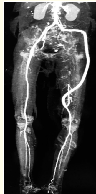
Figure 4: CTA one month after the extra-anatomic bypass showing the course and patency of the graft and ruled-out peri-graft collections.