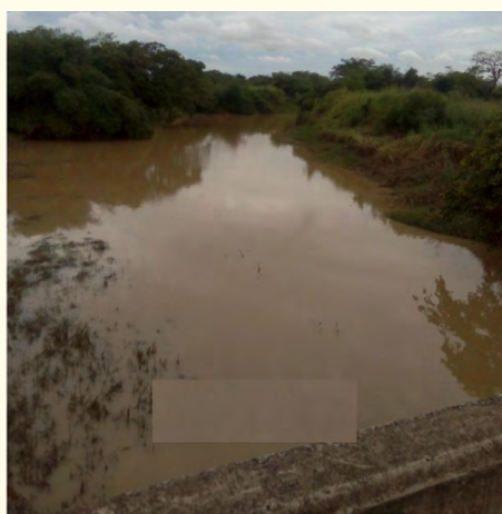
Plate 1: Pictorial view of a tributary of Ivo River close to Ehu dam revealing features of stream water in the study area.