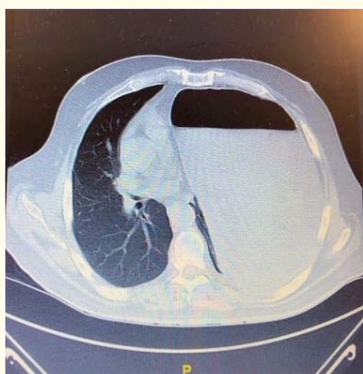
Figure 2: Computed tomography of abdomen shows distention of the stomach due to air, with herniation, compromising mediastinal structures.