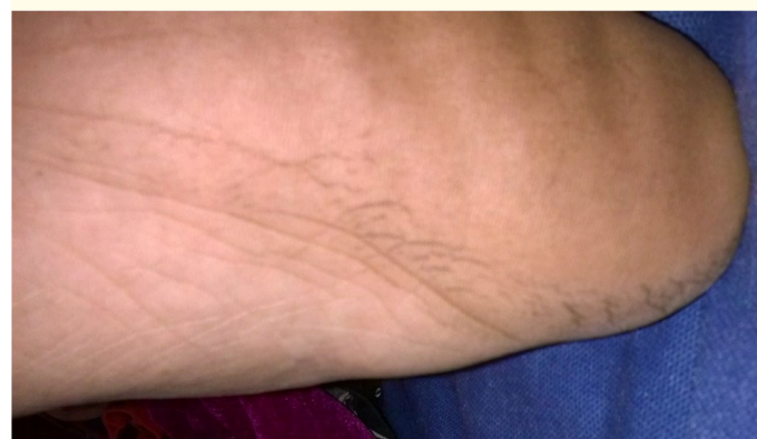
Figure 4: Crackles at the sole and heel of the foot.