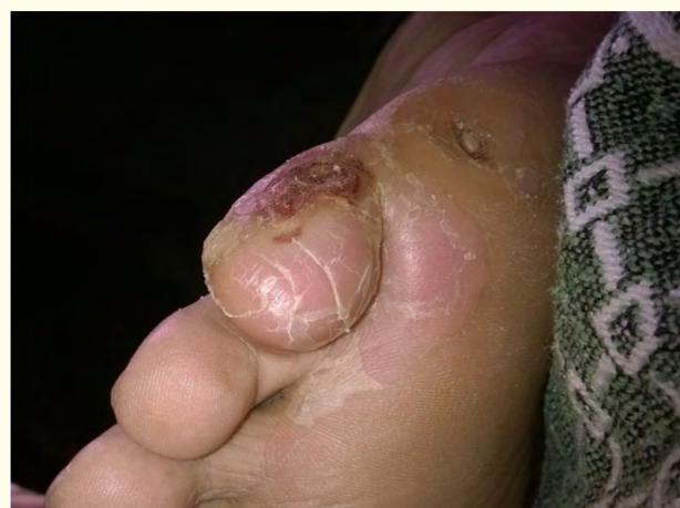
Figure 2: ulcer at the fifth toe.

and 12 (16.9%) symptomitized patients had critical limb ischemia. This difference was statistically significant. According to intima media thickness: there were 2 (20.0%) non symptomitized patients with normal intima media thickness, while 2 (20.0%) non symptomitized patients with decreased intima media thickness, whereas 6 (60.0%) non symptomitized patients with increased intima media thickness, while there were 3 (4.2%) symptomitized patients with normal intima media thickness, whereas 1 (1.4%) symptomitized patients with decreased intima media thickness, while 67 (94.4%) symptomitized patients with increased intima media thickness. This difference was statistically significant as shown in table 7.