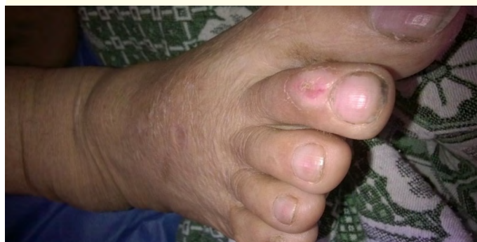
Figure 3: Claw toes and healed ulcer at the top of the second toe.