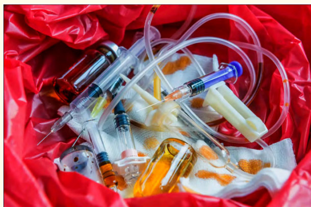
Figure 3: Healthcare solid waste management challenge.

Infectious and hazardous waste; healthcare waste can spread infections, and its improper handling poses risks to healthcare workers and the public. Cost-effective solution; many healthcare facilities, particularly in developing nations, face financial difficulties and struggle to afford safe and effective disposal methods. Regulatory and staff limitations; A lack of appropriate legislation and specialized, trained clinical staff contribute to mismanagement. Environmental pollution; incineration can release air pollutants, while the overall waste stream from healthcare can lead to environmental damage. Increased waste; events like pandemics can dramatically increase the amount of potentially infectious waste (e.g., personal protective equipment), creating an immediate strain on management systems.