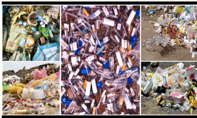
Figure 2: Municipal solid waste management challenges.

Financial and resource constraints; Limited funding is a major barrier, preventing necessary upgrades to collection and disposal facilities. Agencies often lack financial and human resources, especially in developing areas. Population and urbanization; rapid urbanization and population growth outpace the capacity of existing waste management systems, creating a continuous strain. Public engagement and awareness; poor or non-segregation of waste at the source, lack of awareness, and negative attitudes from the public hinder effectiveness. Inefficient operations; services are often inefficient, and there is a lack of technical know-how and initiatives to improve management.