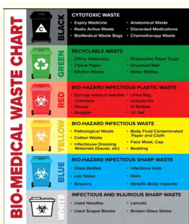
Figure 4: Proposed healthcare solid waste management.

landfills, improving infrastructure and funding, and ensuring that both healthcare and municipal waste workers are properly trained and equipped with safety gear. A lack of comprehensive policies, inconsistent funding, and poor public awareness and compliance remain significant barriers to success, highlighting the need for stronger governmental action, better public education, and improved methodologies in waste management practices.