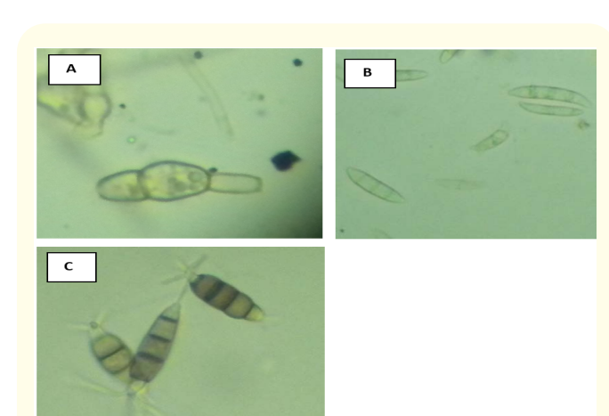
Plate 2: Conidia of A: Alternaria solani; B: Fusarium oxysporum and C: Pestalotia guepini.

Five fungi were isolated and based on cultural and microscopic characteristics they were identified as Alternaria solanii, Fusarium oxysporum , and Pestalotia guepini (Plates2 A, B and C) respectively. Lasiodiplodia theobromae and Sclerotium rolfsii were also identified accordingly. While the first three fungi were found in Ukam market, the last two were obtained form Ekim market.