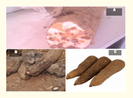
Plate 1A: Yam tubers infected by Dry Rot; 1B: Soft Rot and 1C: Healthy yam tubers.

Survey results from Ukam and Ekim markets indicated high disease incidences of yam rot of 35% and 42% respectively. Infected yam tubers were brown in colour, with hard and dry regions as compared to healthy yam tubers (Plate 1 A, B and C).