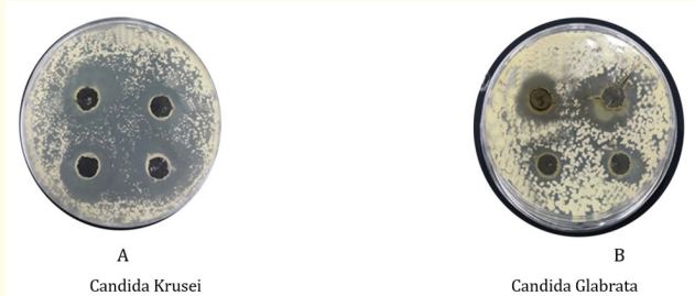
Figure 4: Different solvent extract concentrations of C. Intybus against Candida Krusei and Candida Glabrata .

The MIC for the chicory extract was 50 µg/mL for C. krusei and 100 µg/mL for C. glabrata . and low effects for other candida On the contrary, in the evaluation of different concentrations of the chicory extract by the agar well diffusion method, C. krusei 's lack of growth in similar concentrations was greater than that of C. glabrata . And other candida. As a result, the findings related to both the methods of agar well diffusion and MIC prevention concentration maximization proved that C. krusei sensitivity to the chicory extract is more compared with the sensitivity of other candida.