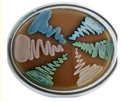
Figure 3: Candida Hichrome Media with different Candida Species.

In a prospective analysis blood samples from clinically suspected cases of septicemia, collected aseptically, were cultured to look for Candida spp. Candida isolates were speciated by Hi-CHROME agar, germ tube tests tests and vitek using standard protocol.