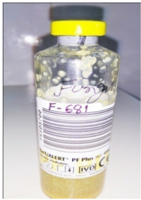
Figure 1: Bac t alert positive blood bottle.