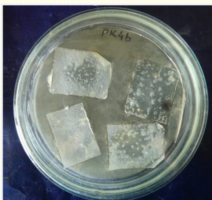
Figure 1: Biodegradation of pieces of LDPE by B. coagulans in Mineral agar after 2-months of incubation at 30°C.

The degradation potential of B. carboniphilus , B. sporothermodurans , B. coagulans , B. neidei , B. smithii and B. megaterium were 34.55%, 36.54%, 18.37%, 36.07%, 16.40% and 34.48% respectively in Mineral agar and 25%, 21%, 16%, 14%, 8% and 21% respectively in Mineral broth. The degradation rate of LDPE in Mineral agar was significantly higher than in Mineral broth (CI =95%) (Figure 1 and 2). In addition, the correlation between weight loss of LDPE and pH reduction was significant (CI =95%) (Figure 3).