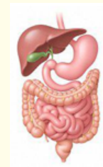
Figure 2: Different segments of the gastrointestinal tract, the liver and gall bladder [5].

Advanced endoscopic techniques such as endoscopic retrograde cholangiopancreatography (ERCP), endoscopic ultrasound-guided diagnostic and interventional procedures or contemporary techniques of surgical resection as endoscopic mucosal resection or endoscopic submucosal dissection can be adopted as cogent diagnostic and therapeutic strategies. Additionally, endoscopic bariatric manoeuvres can be performed in pertinent instances.