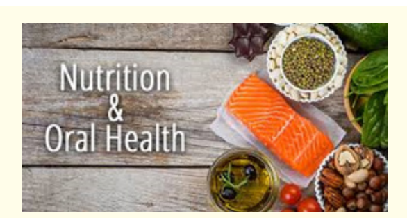
Figure 2: Nutrition and oral health.