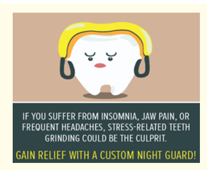
Figure 3: Need of a custom night guard.