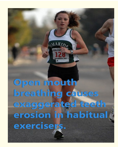
Figure 4: Mouth breathing by athlete.