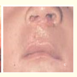
Figure 1: (a) Showing measurements of the cleft dimensions using a caliper and (b)the designing of the flap. (c) 14 months postoperatively.