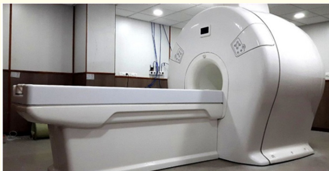
Figure 1: MRI machine.