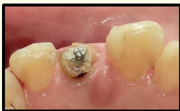
Figure 1: Non restorable upper Lt central incisor.

A 32-year-old female patient was presented to the clinic seeking restoration of a broken endodontically treated upper left central incisor (Figure 1). Clinical examination revealed that the tooth was non-restorable, so we decided to extract the tooth and perform IIP. No signs of acute infection were present. CBCT examination demonstrated an intact buccal bony plate, and sufficient volume of bone apical to the tooth (Figure 2).