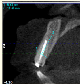
Figure 2: Pre-operative CBCT examination.

After administration of local anesthesia, atraumatic extraction was performed using periostome. Socket curettage was performed, and the extraction socket was examined for the integrity of bony walls. The implant was inserted immediately, and the gap between the implant and the bony walls was filled with xenograft (Figure