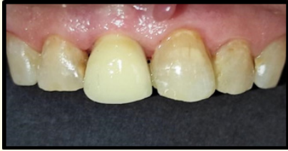
Figure 6: Final restoration.

no complications were reported. The patient was recalled after 4 months and received a PFM crown restoration (Figure 6). Good soft tissue profile could be produced, and the restoration was functionally and esthetically acceptable.