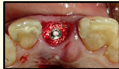
Figure 3: Implant placement and gap grafting.

3). Labial and palatal submucosal pouches were then prepared using 15c blades. PRF membrane was prepared according to [13]. It was then placed over the implant and tucked inside the labial and palatal pouches (Figure 4). Connective tissue graft was harvested as described by [14] as a de-epithelialized free gingival graft. Adaptation of the CTG was done according to [15]. It was pulled inside the pouches by horizontal mattress suture tied at the vestibular end of the pouches, then a cross-over suture was placed over the socket (Figure 5).