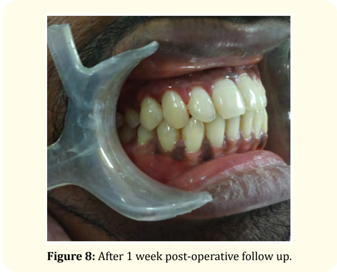
Figure 8: After 1 week post-operative follow up.

Follow up was done at 1 week, 1 month and 2 monthss which showed good healing and no recurrence (Figures 8 and 9).