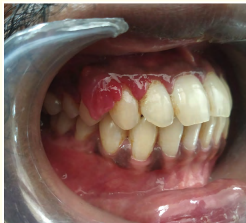
Figure 2: Buccal view of gingival overgrowth.