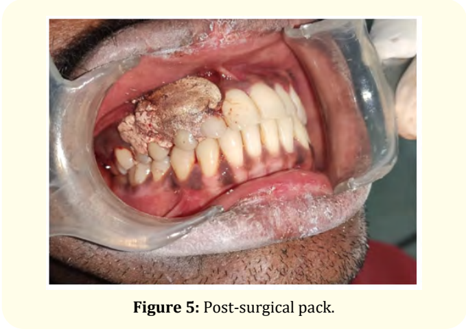
Figure 5: Post-surgical pack.