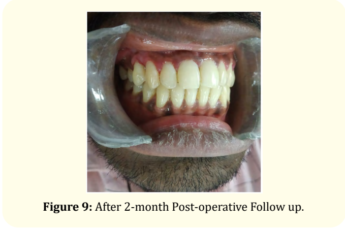
Figure 9: After 2-month Post-operative Follow up.