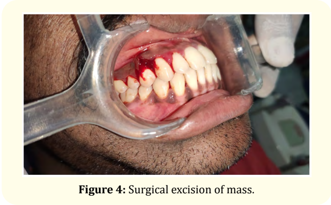
Figure 4: Surgical excision of mass.

15 blade, the mass was excised in toto from its base (Figure 4 and 5). The area was debrided and irrigated using saline and betadine and prophylaxis was done. In a sterilized container tissue was sent to oral pathology laboratory for examination (Figures 6 and 7). Results of pathological examination showed connective tissue rich in vessels and presence of polymorphonuclear neutrophils were in large number which indicated pyogenic granuloma.