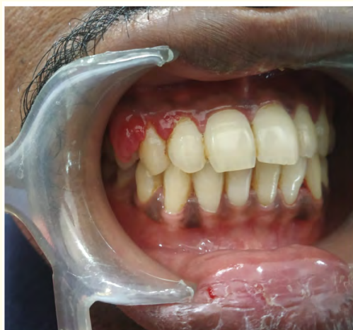
Figure 1: Clinical presentation of lesion.

Oral examination revealed Single swelling present on labial gingiva between 12, 13 and 14 region measuring 1.5 X 0.8 X 0.5 cm in dimensions. Swelling was elevated, non-ulcerated surface, reddish in color, and painless. On palpation all inspeactory findings were confirmed. Swelling was sessile with lobulated surface, soft in consistency, painless and showed bleeding upon slight touch (Figure 1). Accumulation of plaque along with poor oral hygiene was seen in the patient (Figure 2). Radiographic evaluation showed absence of bone involvement (Figure 3). The provisional diagnosis was Fibroma and inflammatory epulis.