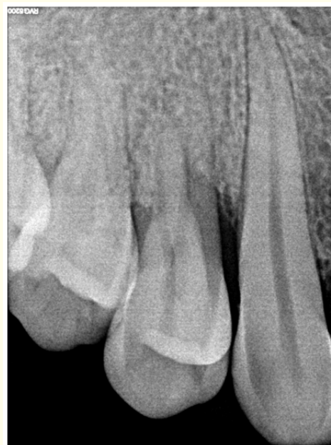
Figure 3: Radiograph of the site of lesion.

Oral health education was given to patient for Maintenance of oral health as well as oral hygiene. After routine blood investigations which were within normal limits patient was planned for the complete excision of the mass. Following mechanical debridement and an antiseptic prescription, a marked improvement in gingival health was noted during the reassessment. The surgical phase involved the removal of the tumour. The growth was adherent to the marginal gingiva and interdental papilla of 13 and 14. Using no.