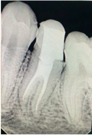
Figure 3: Post operative.

root canal morphology. Two canals are also frequently present in this tooth type; their frequency ranges from 1.2% to 29% [8]. Three canals are more common than four or five, however only case studies have documented the occurrence of four or five canals. The prevalence of three canals ranges from 0.4% to 0.5% [9]. In mandibular second premolars, the C-shaped root canal morphology is uncommon, while it is prevalent in other tooth types. According to a 2012 study by Yu., et al. 0.6% of the 178 mandibular second premolars from a Chinese population that were examined by CBCT had C-shaped root canals. All tooth types have a reported prevalence of C-shaped canals ranging from 2.7% to 8%, with the mandibular second molars, mandibular first premolars, mandibular third molars, mandibular second premolars, and maxillary first molars being the most frequently affected [1]. A crucial part of endodontic treatment is radiographic evaluation [10]. Because radiographs may only approximate the abnormal anatomy in this case report and cannot provide a definitive diagnosis, CBCT was recommended. One of CBCT's benefits is that it can be used for endodontic diagnosis, treatment guiding, and post-treatment evaluation, since it produces narrow field-of-view, three-dimensional digital images at low dose with adequate spatial resolution. A detailed insight of the root canal anatomy is provided to the clinician by the combination of sagittal, coronal, and axial CBCT images.