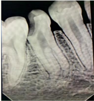
Figure 1: Preoperative.

lasted for few minutes and then subsided on its own. An intraoral clinical examination of tooth #35 with pain to percussion revealed a deep carious lesion. Radiovisigraphy (Figure 1) showed that #35 had a complicated, unique root canal morphology and lacked periapical radiolucency.