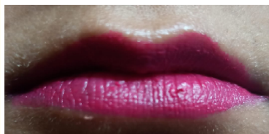
Figure 1: Anatomy of lips.

Cheiloscopy is acquired by two Ancient Roman words ‘cheilos’-lips and ‘skopein-study’ [1,4-7]. The characteristic pattern of elevations and depressions (i.e. crinkles and fissures) on mucosal membrane of lips called as “sulci labiorum rubrorum” make a special design on lips and investigation of these designs on lips is named as cheiloscopy (Figure 1) [2,3,7-11]. Cheiloscopy is used as an evidence based inspection method which deals with human recognition based on drafts of lip designs [12]. Like finger patterns ‘lip prints are also distinctive for a person [1,6,10]. It act as anatomical character of human identification and sex determination. [1,2]. Lip designs are evident very soon i.e. in one and half month of embryo in womb of mother and won’t modify throughout whole lifespan of a human [1,6,8,11]. These white areas seemed in lip prints are the creases on the vermilion border of the lips and the dark areas are the raised red areas outlined by creases, are similar to the furrows and ridges of friction ridge skin [9].