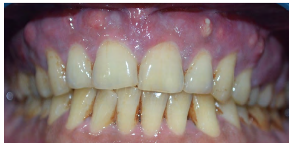
Figure 1: Labial view.

Suggestive of pathological changes of sinus lining and inflammation of the mucosal lining of the sinus. The palatal cortical plate with the tuberosity and the alveolar bone around the 26,27,28 shows mild trabecular thinning and sinus floor periapical to the 27 shows resorption and thinned out the floor with loss of corti-