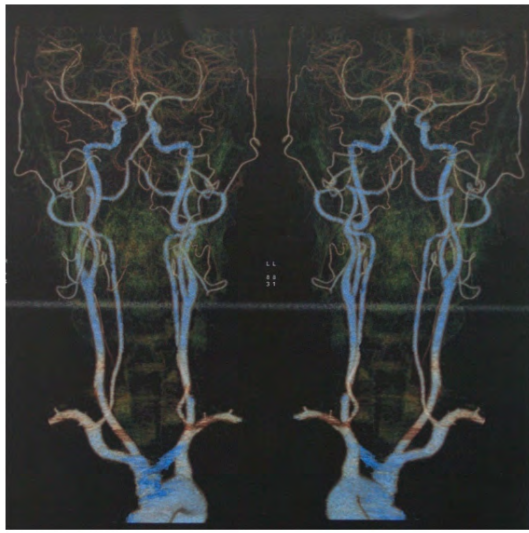
Figure 3: CT angiogram.