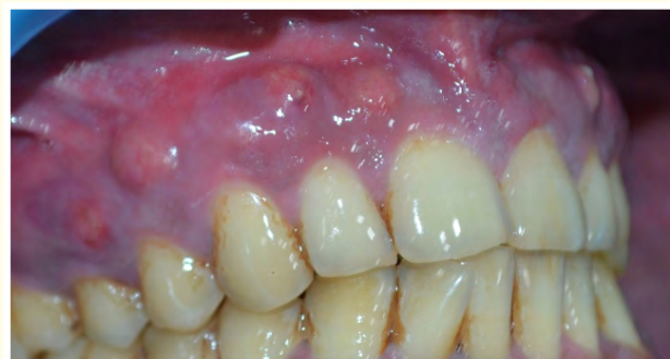
Figure 2: Multiple Pus filled vesicles in Buccofacial region.

cal plate. The palatal cortical plate shows irregular resorptive changes in the 26,27 region particularly. The trabecular pattern of the 24 - 25 area also shows mild thinning and reduced density with likely resorptive changes. The right alveolar bone with the tuberosity area does not show any changes. CT angiogram was also done to rule out any thrombosis in vasculature in the oro-facial region due to COVID-19 (Figure 3 and 4). CT Angiogram shows no evidence of thrombus in the oro-facial region. Extraction of mobile teeth along with curettage of the involved region was planned under aggressive antibiotic and antifungal agents. The patient was also explained with various rehabilitation options post healing like Dental Implants and Removable prosthesis also patient was asked to control his blood glucose levels with a proper treatment plan to avoid future complications.