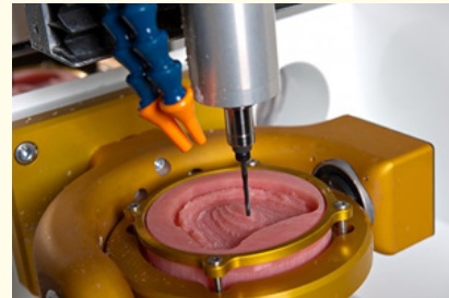
Figure 1: Milling of dentures: AvaDent denture being milled from a Lucitone 199@puck.

implant-supported over dentures, particularly when the inter arch space is very limited.