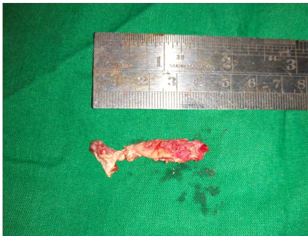
Figure 5: Excised coronoid process along with stripped temporalis muscle.

Coronoidectomy remains the single best surgical option for extra-auricular ankylosis. Depending upon the extent and location of ankylosis approached can be intra or extra-oral. One of the advantages of extra-oral approach is accessibility with scar and facial nerve injury as disadvantage. Intraoral approach may be tedious and access could be very difficult. Also, through intraoral approach,