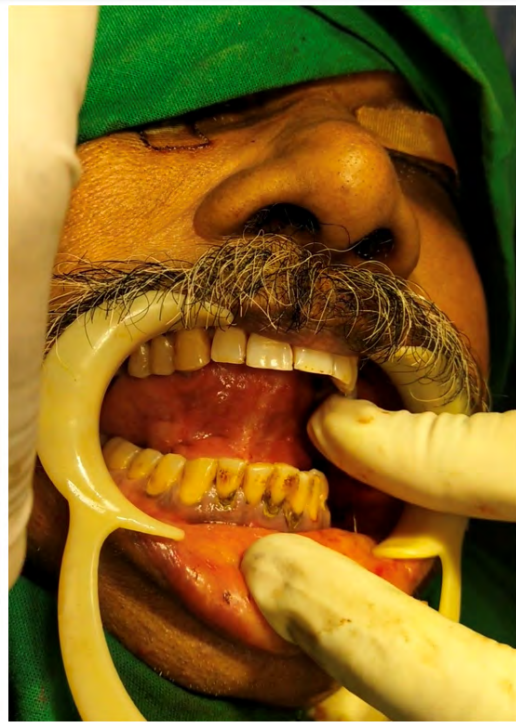
Figure 4: Mouth opening immediately following coronoidectomy.