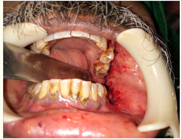
Figure 6: Incision was closed with 3-0 vicryl with a watertight closure.