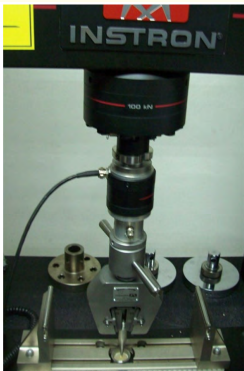
Figure 2: Instron universal testing machine.