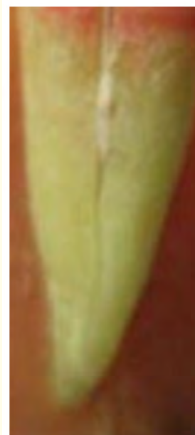
Figure 3: Fracture of the root.