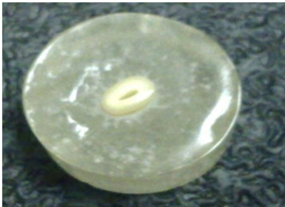
Figure 1: The acrylic resin block.

min), and directed parallel to the long axis of the roots (Figure 2). The force level at which the fracture occurred was measured and recorded in Newton (Figure 3).