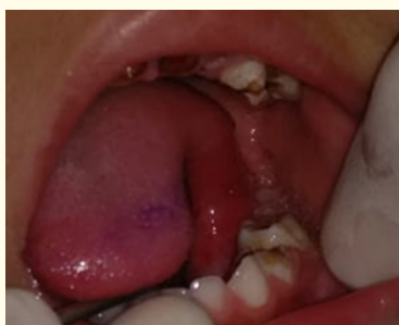
Figure 2b: Preoperative mandible (left).

The child exhibited an extremely anxious and apprehensive behaviour during her first working appointment and fell into a definitely negative rating on the Frankle Behaviour Rating scale. Due to the need of a full mouth rehabilitation procedure and the uncooperative behaviour of the child, the parents were explained about the requirement of treatment to be done under general anaesthesia.