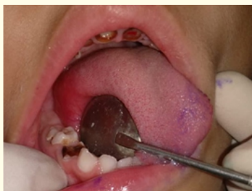
Figure 2a: Preoperative mandible (right).