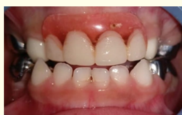
Figure 6: Postoperative frontal.