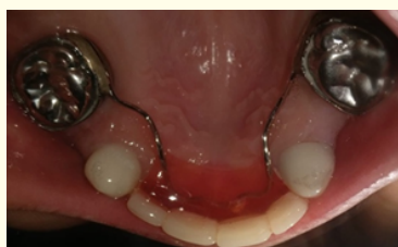
Figure 5a: 6 months recall (maxillary arch).

They were instructed to return every 3 months for a follow up. At the 6 month follow up all the crowns, prosthesis and space maintainers remained intact with no further carious lesions detected (Figure 5a, 5b and Figure 6).