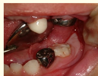
Figure 4b: Immediate postoperative view (left mandible).