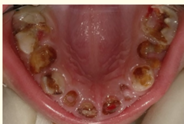
Figure 1: Preoperative view - maxilla.

The clinical examination disclosed the presence of severe early childhood caries with gross amount of coronal destruction in most of the anterior teeth. Deep caries was seen in #53 #55 #63 #65 #74 #75 #85 indicated for pulpectomy followed by crowns. #51, #52, #61, #62, #54, #64 and #84 were grossly carious indicated for extraction followed by a space maintainer (Figure 1, Figure 2a, 2b).