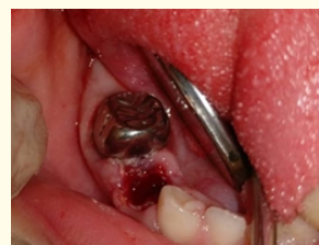
Figure 4a: Immediate postoperative view (right mandible).