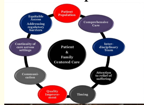
Figure 2: Components of palliative care.

(www.google.geriatric-population-geriatric-palliative-and-endoflife-care-9-638).