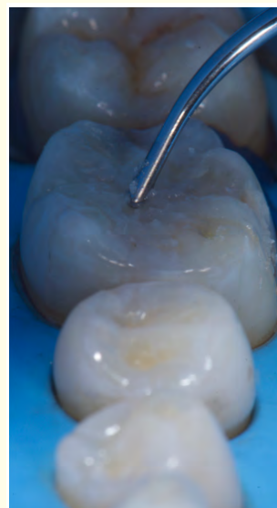
Figure 12: Compacting the alkasite in the cavity.

Once the material is completely mixed it is ready and is carried to the cavity with the plastic spatula included in the kit, it is recommended to place into the cavity as fast as possible, approximately after mixing it has a working time of two and a half minutes, at this point you will be able to use the instruments that are used in resins, trying to compact the material as best as possible and give at least one primary anatomy (Figure 12 and 13).