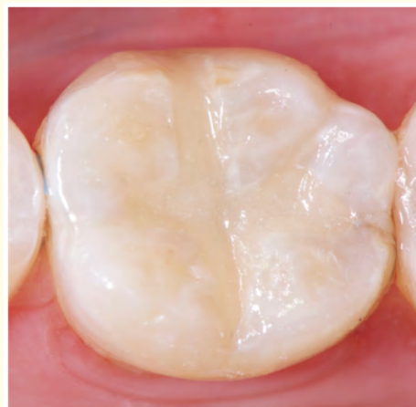
Figure 15: Restoration finished with Cention-N.

Cention N ® comes only in A-2 Vita color but the great advantage is that the color merges with the tissues of the dental organ. Cention-N mimics the restored cavity and looks with a blended color after adjusting and polishing (Figure 15).