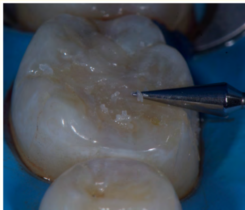
Figure 13: Modeling of the primary anatomy.

After giving the primary anatomy or if we do not reach the technique described that we will be able to complete the anatomy with strawberries of fine grain diamond or with strawberries of finished 12 leaves with irrigation, so as not to dehydrate the filling material. The material can be placed with one increment, self-curing with light curing option, you will have a hardening within four minutes and its recommended to use a LED lamp (400 nm to 500 nm). The material is indicated in Classes I, II and V, both temporary and permanent dental organs (Figure 14).