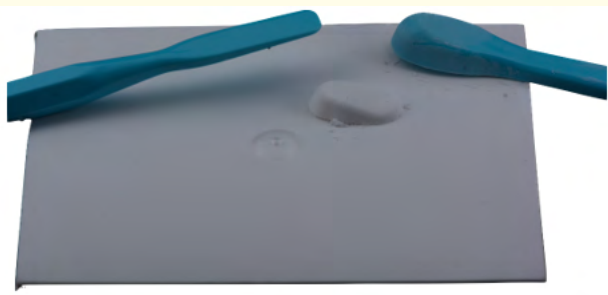
Figure 10: Dosage of powder and liquid. Ready for the spatulation.

The technique suggests before using the powder shake it to stir all the active components, the case features a spoon for powder, which is dispensed by removing all the excess in the same jar lid and this ensures exact dispense the powder, subsequently to dispense the liquid it is recommended to face it in a vertical way, where will the liquid and will have to be at the bottom and press firmly but once for the liquid to flow (Figure 10).