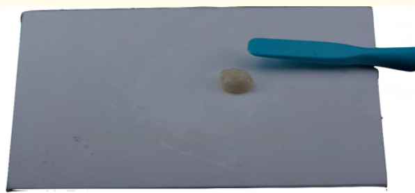
Figure 11: Aspect of the alkasite once mixed.

nipulated and what is more important, it is not going to integrate to the tissues of the dental organ. Once the material is mixed it can be compacted in a sphere and must be observed shiny or glazed and at that point it may be placed in the cavity with the spatula that brings in the case. It should be noted that the kit includes the spatula for mixing the cement and, on the other hand brings the spatula to take him to the cavity (Figure 11).