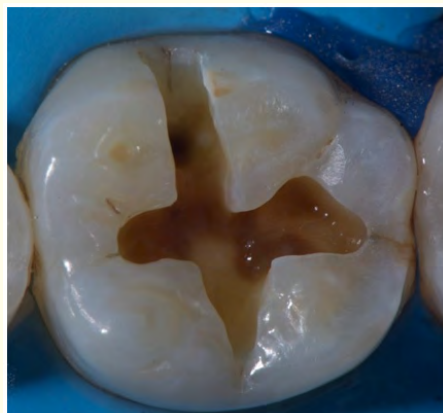
Figure 6: Cavity with firm dentin and healthy enamel.

After being sure that we have affected tissue and not infected, the cavity is rinsed with water and dried, without dehydrating where a wet dentin is needed, to avoid collagen fibers collapse (Figure 6).