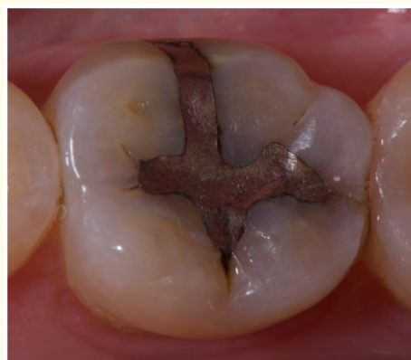
Figure 1: Amalgam restoration to be replaced.

A female patient of 34 years of age presents to the practice. The chief complaint is to change the amalgam of mandibular first molar on the left side. Pain, mainly due to the chewing and to changes in temperature, in this molar has craze lines which can be suspected as fractures, at the same time it is observed changes of color through the enamel and can be recurrence of demineralized tissue. The patient reported that already has approximately 21 years with the restoration, so it is recommended to change the amalgam. In this restoration of amalgam is decided to remove it and replace it with an alkasite restorative material, with previous consent of the patient (Figure 1).