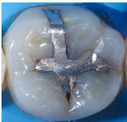
Figure 3: Absolute isolation of the surgical field.

It was decided to place an alkasite by the properties already exposed, but we emphasize their bioactive properties [6,22,23] as the patient presents multiple dental cavities in her teeth, mainly because of its acidic pH. Absolute isolation of the operative field, which is indispensable for placing any restorative material in the dental organs (Figure 3).