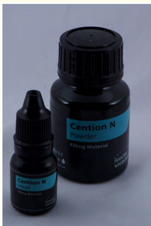
Figure 9: Cention N®. Powder and liquid.

The technique suggests before using the powder shake it to stir all the active components, the case features a spoon for powder, which is dispensed by removing all the excess in the same jar lid and this ensures exact dispense the powder, subsequently to dispense the liquid it is recommended to face it in a vertical way, where will the liquid and will have to be at the bottom and press firmly but once for the liquid to flow (Figure 10).