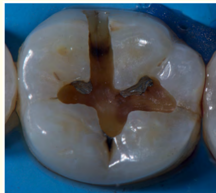
Figure 4: The amalgam is removed with a carbide bur number 2.

After the isolation the amalgam is removed with a carbide bur # 2, with plenty of water, to try to damage the less possible the enamel and dentin. Another very important justification to place absolute isolation, to avoid contamination of the patient by amalgam contamination (Figure 4).