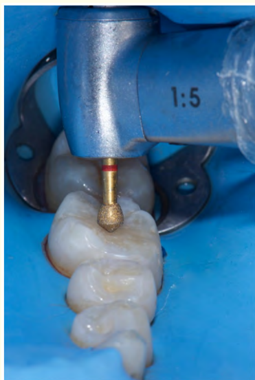
Figure 14: Trimming and adjustment of the restoration.

After giving the primary anatomy or if we do not reach the technique described that we will be able to complete the anatomy with strawberries of fine grain diamond or with strawberries of finished 12 leaves with irrigation, so as not to dehydrate the filling material. The material can be placed with one increment, self-curing with light curing option, you will have a hardening within four minutes and its recommended to use a LED lamp (400 nm to 500 nm). The material is indicated in Classes I, II and V, both temporary and permanent dental organs (Figure 14).