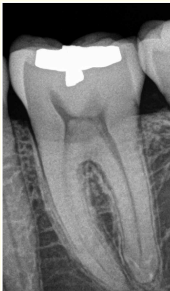
Figure 2: Preoperative x-ray.

molar there were no radiographic signs, including the restoration presents not a big depth in terms of their relationship to the pulpal tissue. The problem of its sensitivity is the marginal leakage (Figure 2).