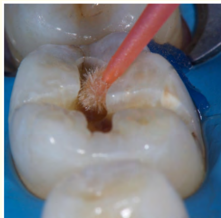
Figure 8: It is placed a layer of Adhese universal.

Once the margins were prepared, the cavity is ready to apply the Cention-N. The technique recommends the following: If the cavity is retentive, the adhesive isn't recommended, when used without adhesive there's no need to apply phosphoric acid. However, this alkasite can be used with adhesive too. If used with an adhesive, the cavity is prepared according to modern principles of minimally invasive dentistry, that is to say, preserving as much as possible of natural dental structures and following the instructions for use on the packaging and the application, therefore in this case it is recommended the use of a self-etch adhesive with selective etching [18]. In this particular case it was considered the use of self-etch adhesive but instead we used Adhese Universal of Ivoclar Vivadent®, one layer is placed, rubbed 20 seconds and light cured with Blue phase LED lamp® Style of Ivoclar Vivadent (Figure 8).