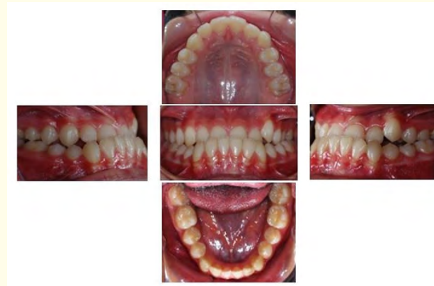
Figure 7: Case 7.