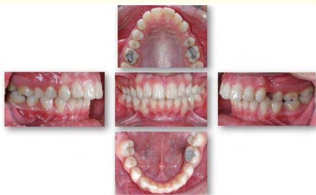
Figure 4: Case 4.