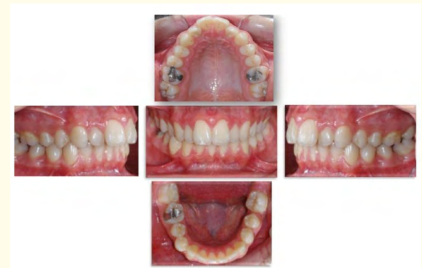
Figure 5: Case 5.