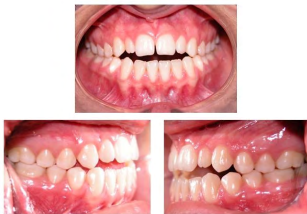
Figure 3: Case 3.