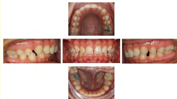
Figure 6: Case 6.