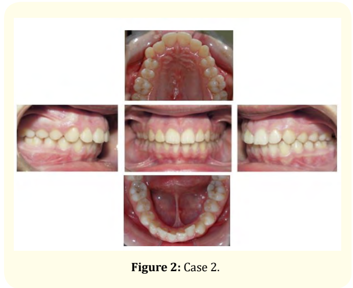
Figure 2: Case 2.