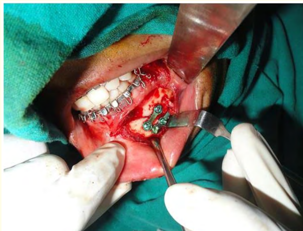
Figure 3: Patient treated with conventional miniplate (Group B).