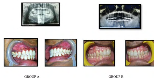
Figure 5: Postoperative photographs of Group A and Group B patients.