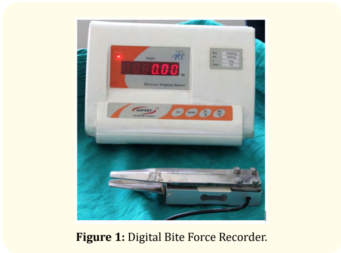
Figure 1: Digital Bite Force Recorder.

Assessment of the patients in postoperative phase was done under the following parameters: occlusion, infection, paresthesia, malunion/nonunion, segmental stability, biting efficiency (using digital bite force recorder) (Figure 3) after one month. The evaluation was done at the immediate postoperative day, at 1 week postoperatively and at 1 month postoperatively (Figures 4 and 5). Each complication was recorded according to type of plates used. Parametric data was evaluated with independent student t test (by using SPSS version 17; SPSS, Inc, an IBM Company, Chicago, Illinois). A P value less than 0.05 was considered statistically significant.