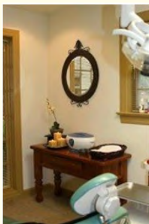
Figure 2: Paraffin wax hand station.

In the early days, there was some experimentation with offering traditional massage and facials alongside dental services. But the dentists who tried, found that people would rather go to a real spa to relax. Also, there are dermatologists who offer BOTOX and dermal fillers; so patient wont specially come to a dentist for a cosmetic facelift, but while consulting for a smile design we have to cross convert the patient.