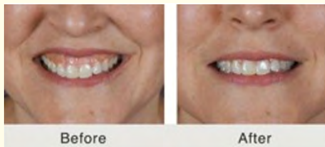
Figure 4: BOTOX for gummy smile - as you can appreciate the correction is achieved by relaxing the elevator muscle of the upper lip.

Bruising and/or pain at the site of injection might be noticed in some cases. There is a risk of drooping of the eyelids and eyebrows but corrects itself within a few months.