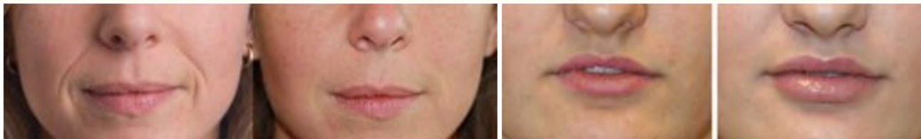
Figure 5: Dermal Fillers - before and after. (left) Nasolabial fold (right) Lips.

Bruising and lumpiness are the common side effects which can be decreased using a micro cannula. Swelling can be noticed for 2 - 4 days, which will settle by itself. Artificial look can be avoided by being conservative and vascular injury can be avoided by complete knowledge of anatomy, careful injection and micro cannula.